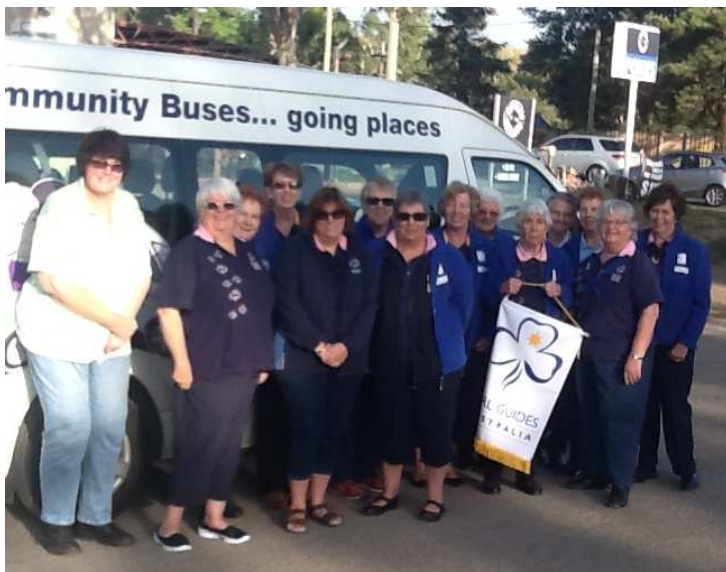
Members of Barwon Trefoil Guild visited South Australia recently – here they are on their way!!